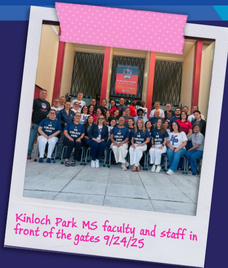
Kinloch Park MS faculty and staff in front of the gates 9/24/25